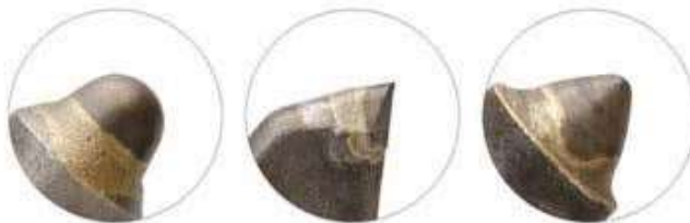
(D) Dome carbide

Available with sharkteeth or conical cutters with aggressive or dome carbides to cover a variety of tough ground conditions