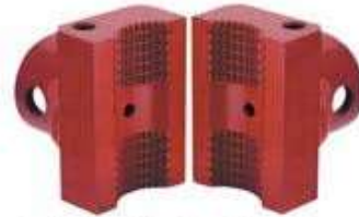
Cylinder Side Breakout Jaws: Breakout wrench replacement jaws