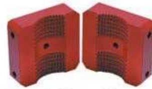
Stationary Side Breakout Jaws: High quality replacement jaws